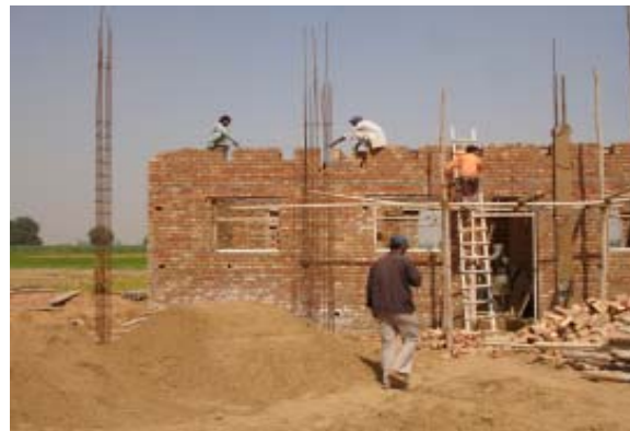
Building work underway in October 2007